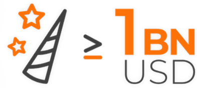
Unicorns: US vs China vs Rest of the World

Europe's relative proportion of unicorn startups is shrinking. While other continents are speeding up.